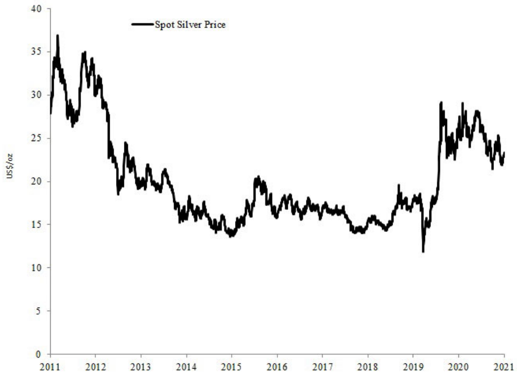
Source: Bloomberg, abrdn Inc. Chart data from 12/31/2011 to 12/31/2021.

Starting in early 2011, when silver prices peaked at $48.44 per ounce, silver prices began a downward trend, albeit with multiple upwards rallies (that have often lasted several months). The rise in the value of the U.S. Dollar, sluggish industrial growth and a tame inflation environment (which led some investors to revise their expectations of the effects of monetary expansion) were some of the drivers behind the fall in silver prices from 2011 to 2019. Silver reversed course in 2020, as prices rose 46.75%, closing at $26.49 per ounce. In 2021, silver took a slight step back after its historic performance in 2020, as it returned -13% (as of December 31, 2021). As the world emerged out of the pandemic, silver took a backseat to riskier asset classes such as equities which is a reason for its negative performance during the year.